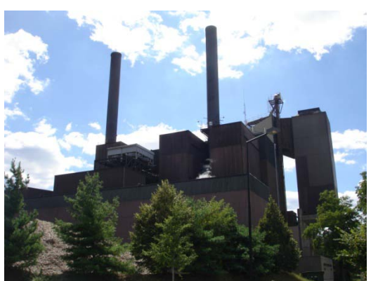
Akron Thermal Limited Partnership (RES Steam Plant)