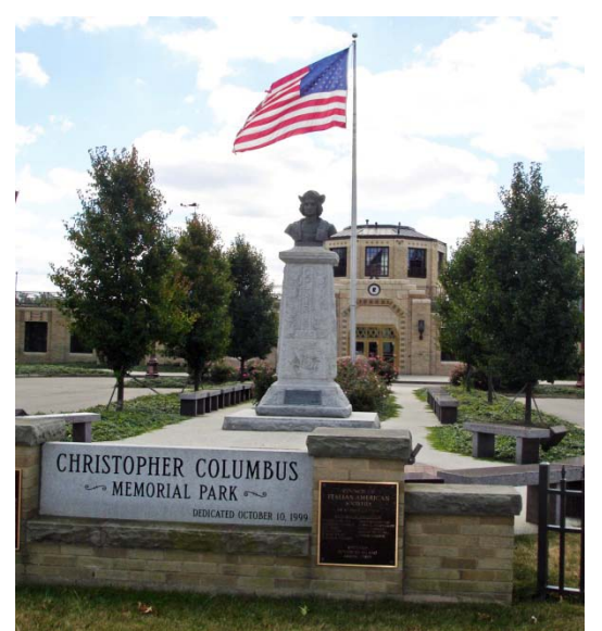
TERMINAL: Akron Fulton Int'l Airport