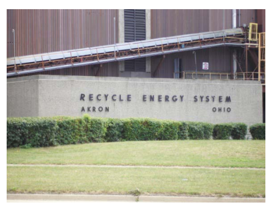
Akron Thermal Limited Partnership (RES Steam Plant entry)

NE Ohio ALS Assn. Chapter 2005 Vision Award